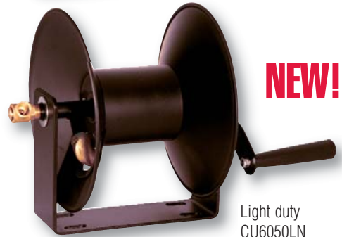
Light duty CU6050LN