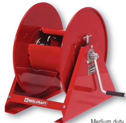
Medium duty H16000

CAUTION: To prevent drum damage fully extend and pressurize hose and rewind on the reel. Stainless models available. See page 16 and 17.