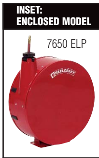
INSET: ENCLOSED MODEL