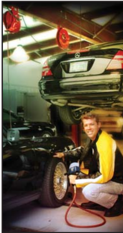
Fry's Napa AutoCare Center, Columbia City, IN