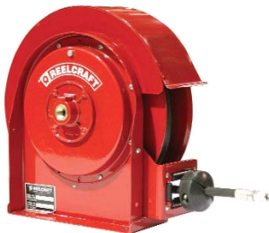
Model Shown: AV4425 OLPBWL