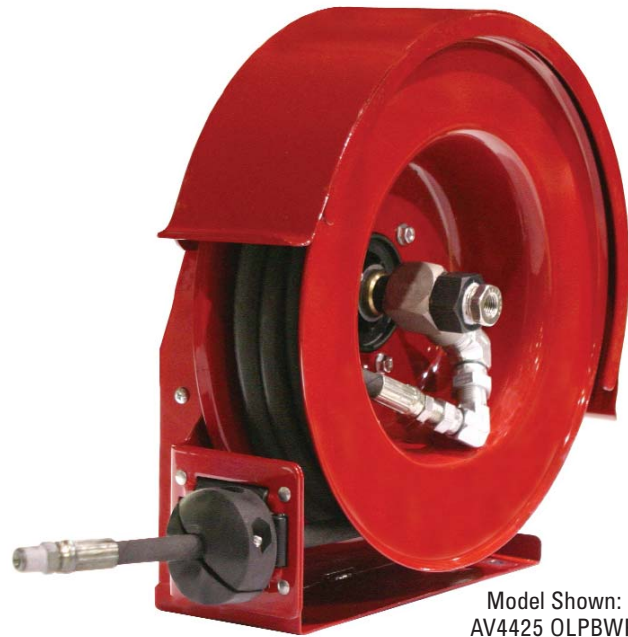
Model Shown: AV4425 OLPBWR

Reelcraft offers a complete line of over 2,500 hose, cord and cable reels. For more information visit us on the web at www.reelcraft.com .