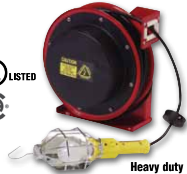
Heavy duty L 4050 163 1