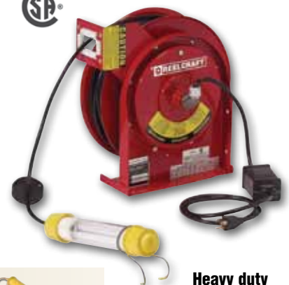
Heavy duty L 4050 162 2