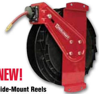
Side-Mount Reels RT650-OLPSM