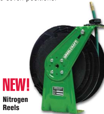
NEW! Nitrogen Reels RT650-OLPG-GN205