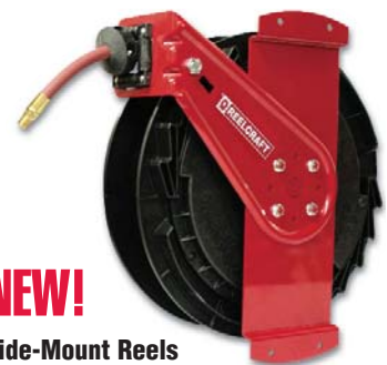
NEW! Side-Mount Reels RT650-OLPSM