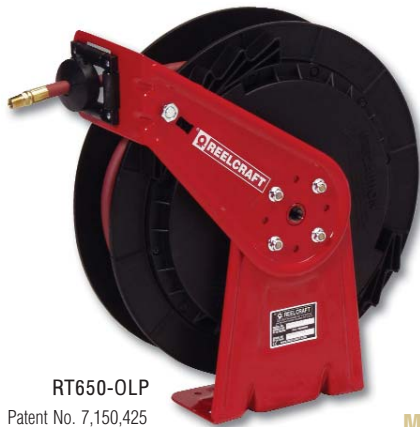
RT650-OLP Patent No. 7,150,425